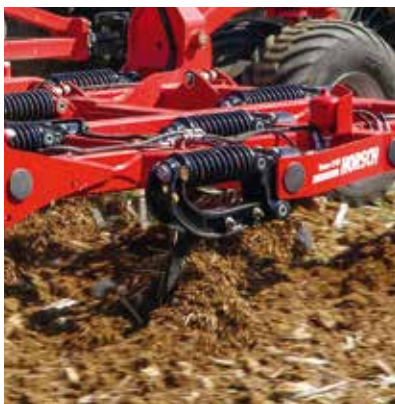
TerraGrip tines of the Terrano 10/12 FM