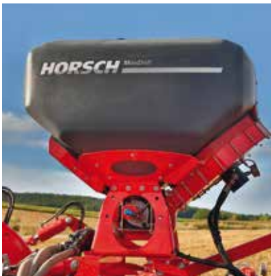
MiniDrill with a hopper capacity of 400 litres