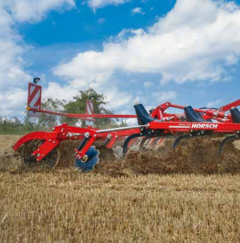
Terrano FX – Universal and low horsepower requirement