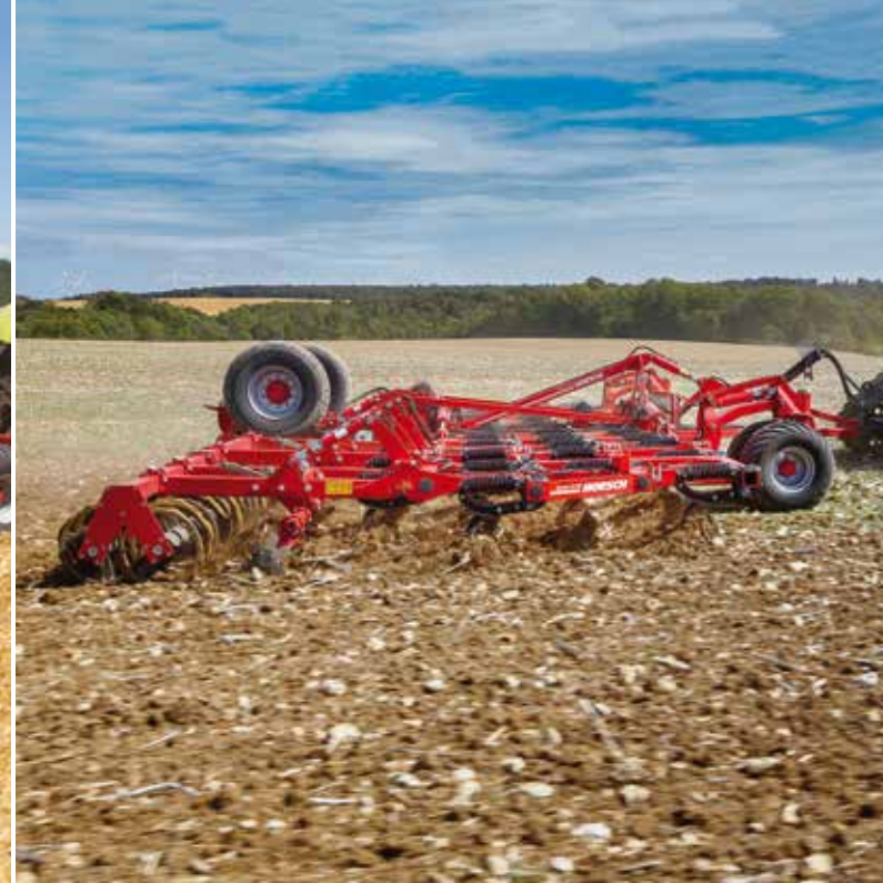
Terrano FM – Efficient universal cultivator