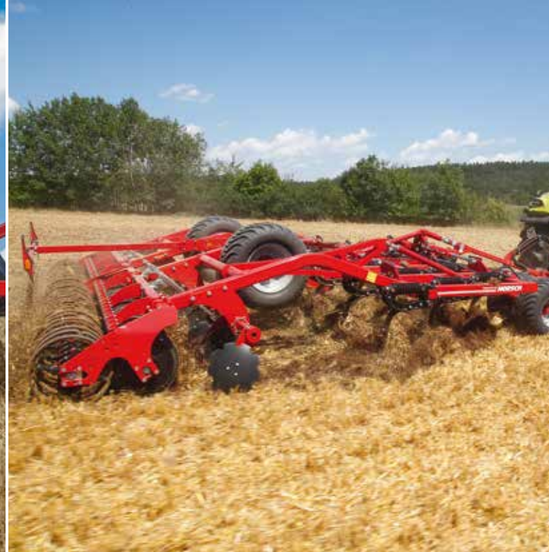
Terrano GX – Elegant all-purpose tool