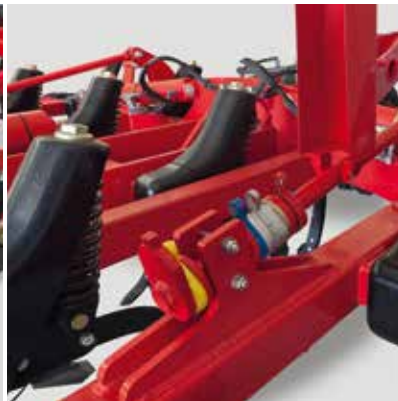
Adjustment of working depth