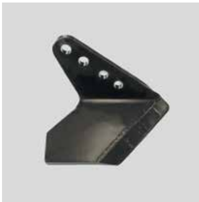
Coulter wings for all-over cutting; working depth can be adjusted in relation to the coulter point in 2 steps; allows for extremely shallow working.