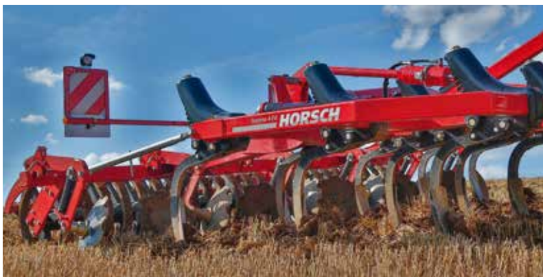
Terrano 4 FX