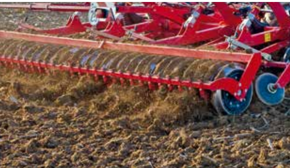
SteelDisc packer for optimum consolidation also on heavy soils