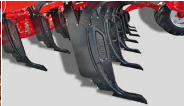
Ultra LD+ coulters loosen the soil deeply and even in heavy soils, do not bring large clods to the surface.