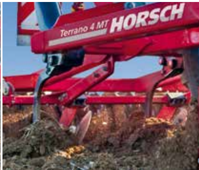
TerraGrip tines with LD coulters for deep loosening of the soil