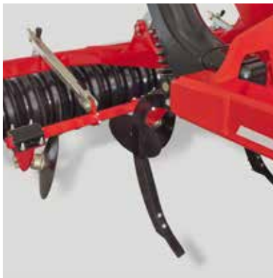
LD coulter at the Terrano MT