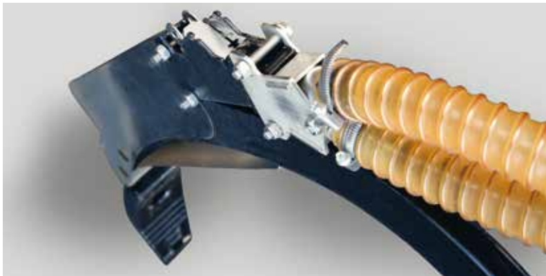
Fertiliser guide plate