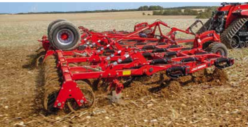
Terrano 12 FM