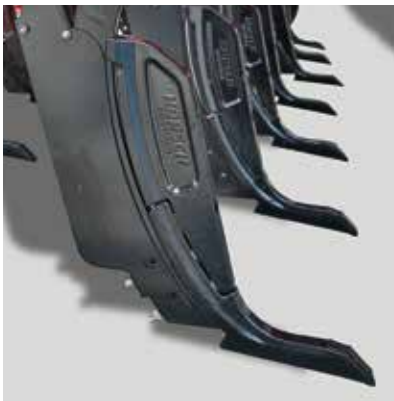
Ultra LD+ coulter as wear part for all cultivators