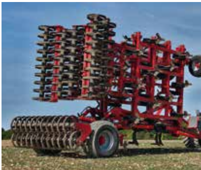
Middle chassis for tight turning on the headlands and excellent roadability.