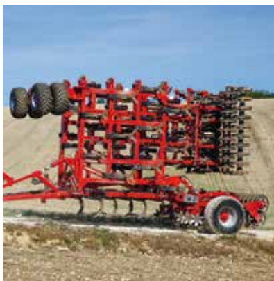
3 m transport width for the Terrano 10/12 FM