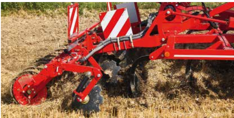
Terrano 3 FX mit shear bolt protection