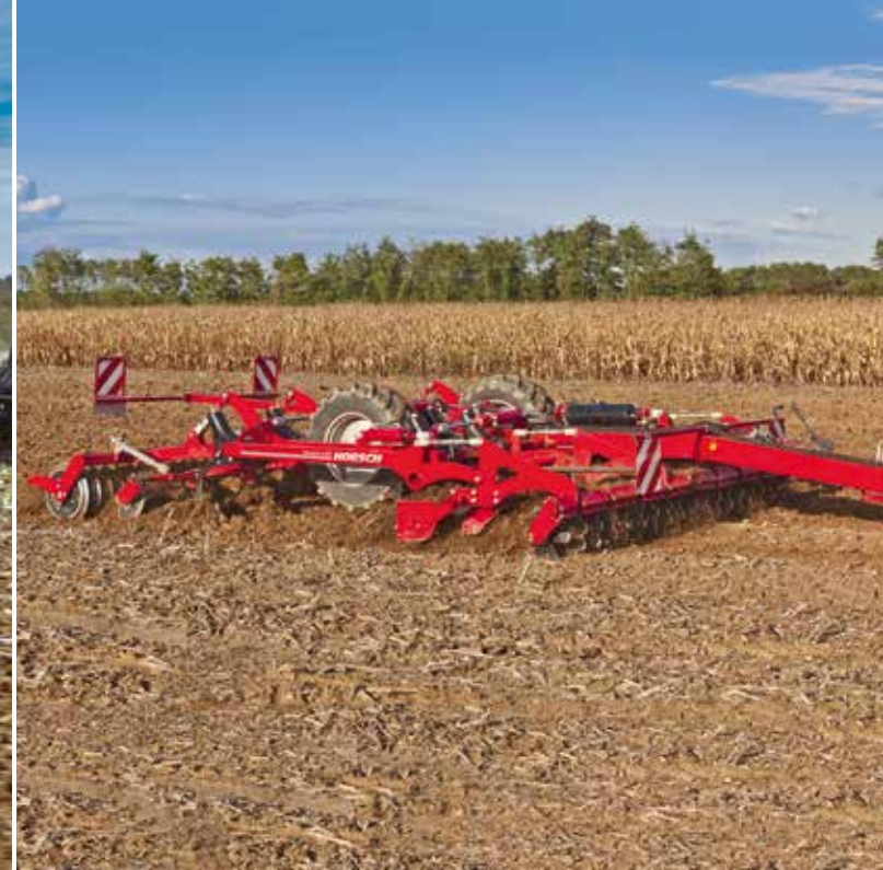
Terrano MT – Shallow mixing – deep loosening