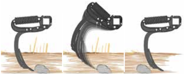
TerraGrip III illustration TerraGrip III 550 kg release force/30 cm trip height. When releasing the force decreases to 170 kg. This releases the stress on the frame.

When avoiding an obstacle, the force of the spring decreases from 500 kg to 175 kg. The force that acts on the frame is thus reduced considerably. The optimised spring kit allows for an exact coulter control in the desired working depth – even in heavy soils and large working depths. Due to high-quality material and large pivot points any greasing points become unnecessary.