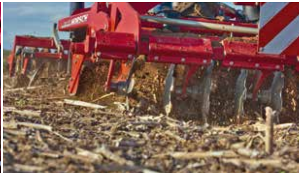
DiscSystem for intensive shallow mixing