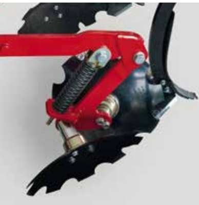
Spring-loaded levelling discs