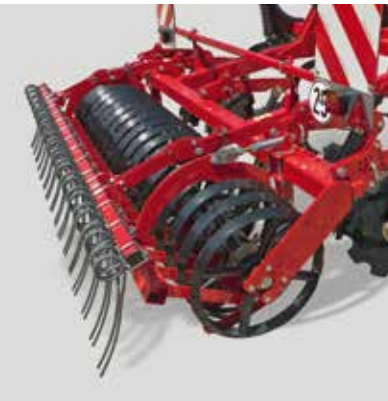
Optional: harrow behind the packer