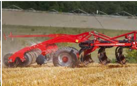
Disc levelling Levellers Transport position Manoeuvrable due to middle chassis